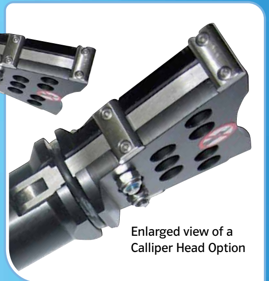
Enlarged view of a Calliper Head Option